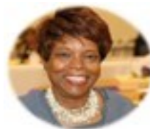
Priscilla Circle Chair